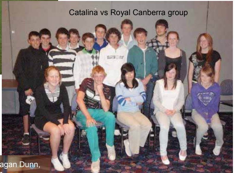
Catalina vs Royal Canberra group