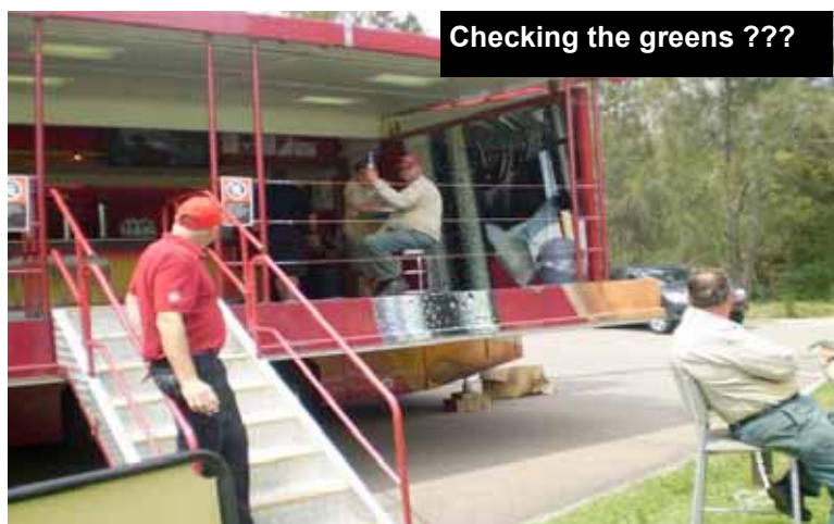
Checking the greens ???